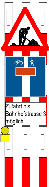
Signalisation Position 2