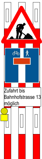
Signalisation Position 1